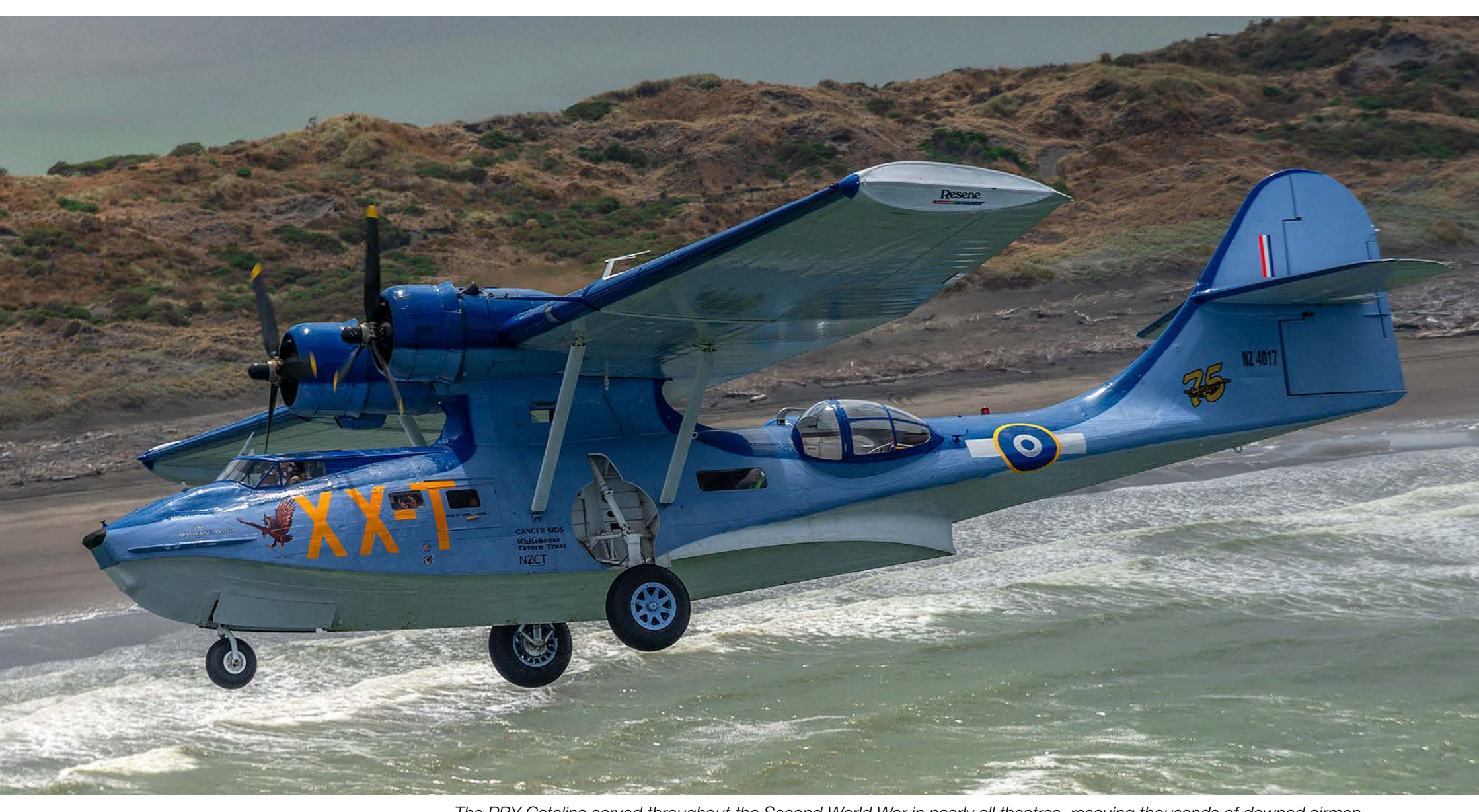
The PBY Catalina served throughout the Second World War in nearly all theatres, rescuing thousands of downed airmen, hunting submarines, or as a resupply aircrat. It was a true workhorse. Since the war it has been used as a fire bomber, executive transport, aerial sightseeing and many other roles. Many are still flying worldwide today.